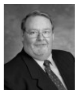
~ <u>Winston Churchill</u>

"The farther backward you can look, the farther